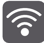
TELECOMMUNICATIONS AND NETWORKS